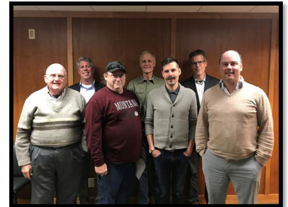
Board of Trustees