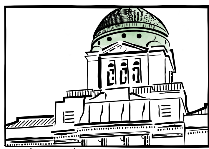
MONTANA STATE CAPITOL