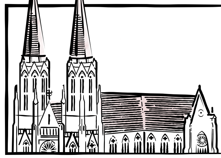
THE CATHEDRAL OF SAINT HELENA