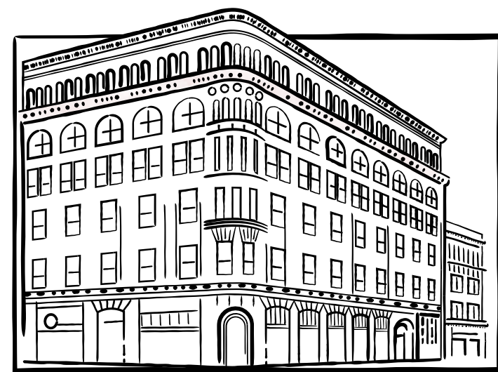
THE POWER BLOCK