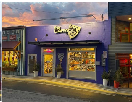
The Garage, a 2022 Recipient Before and After Picture